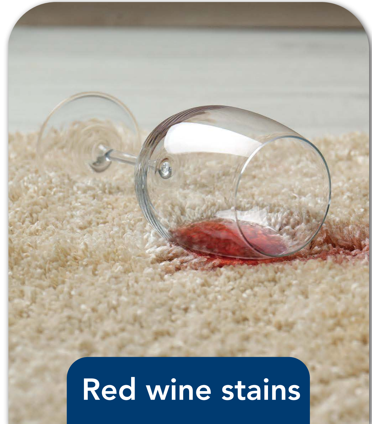
Red wine stains