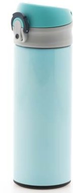
stainless steel container